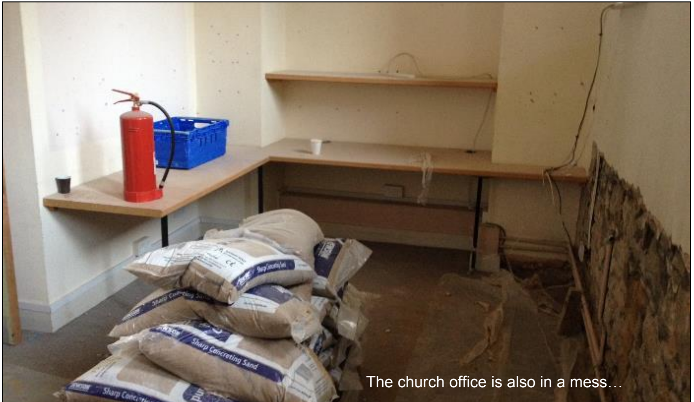
The church office is also in a mess...