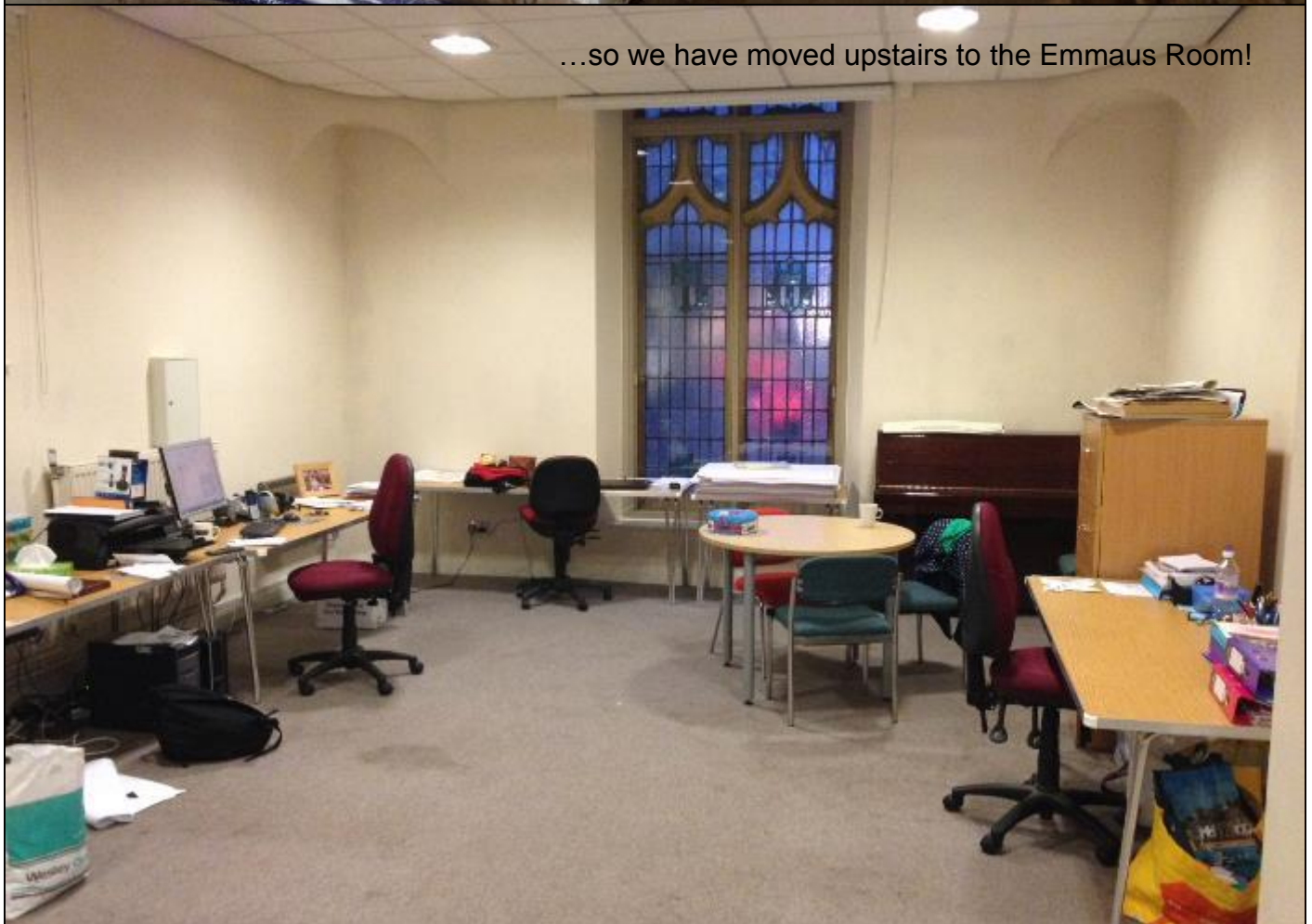
...so we have moved upstairs to the Emmaus Room!