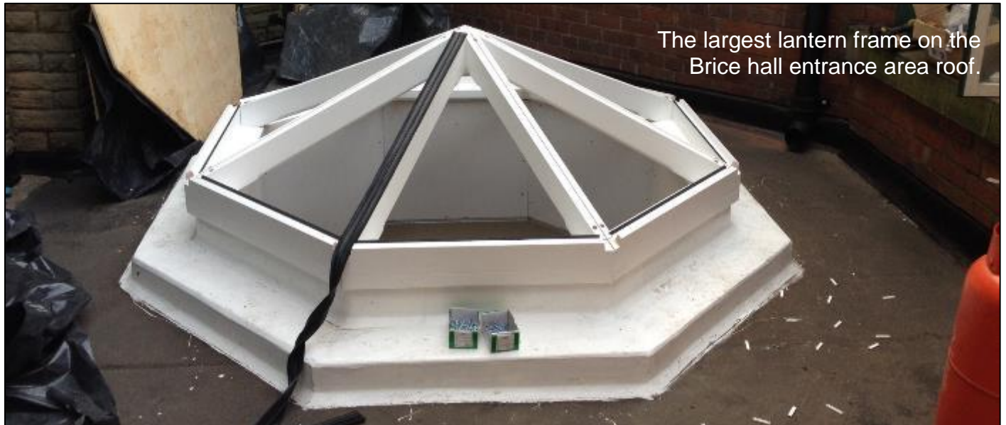
The largest lantern frame on the Brice hall entrance area roof.

The main Entrance Area and office have had plaster removed, ready to treat and replaster